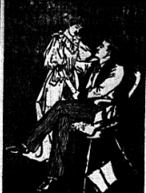
The sympathetic tenderness of a loving husband is everything to an expectant mother...