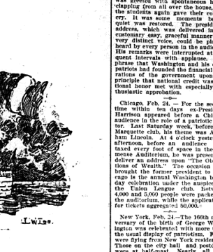
THE RUINED WARSHIP MAINE.

The illustration shows the USS Maine in a state of ruin, with smoke rising from the wreckage. The ship is surrounded by other vessels and structures in the harbor. The scene is depicted in a dramatic and somber tone.